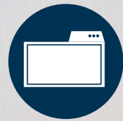
Use of Cortech FSTP

Platinum and Gold Partners will have access to prioritised technical support regarding a wide range of topics. Upon calling the support line, technical partners will be asked to verify their tier level by providing company name, site name, contact name and confirmation of an active support contract. The Cortech Developments support team is engaged, informed and ready to help our technical partners with their questions.