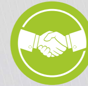
Tech partner agreement

To enquire about your organisation joining our Technical Partner Programme, please contact our Sales Department at sales@cortech.co.uk or 01925 750 600.