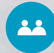
Certified sales staff