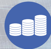
Quarterly Account planning