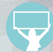
Solutions and demonstrations