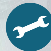
Installation and support