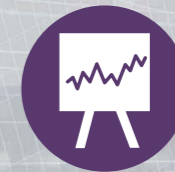
Annual sales and marketing plan