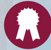
Accreditations and certifications